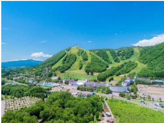
Full view at Rusutsu Resort