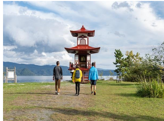
Two-storied tower at Ukimido Park