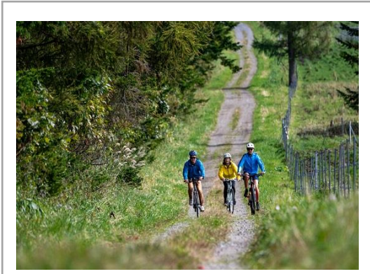
Cycling along rural area