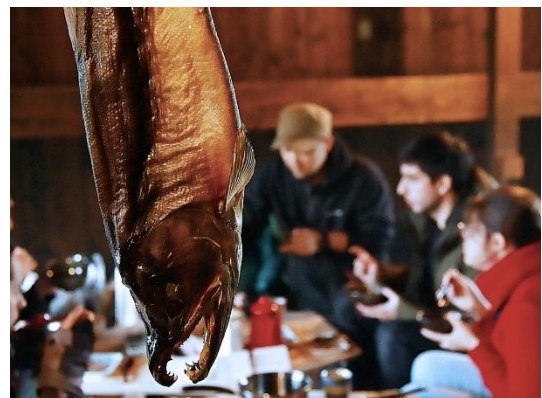
Lunch in an old salmon fisher's homestead