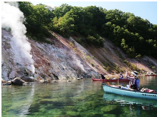
Observe upclose the volcanic hot spots