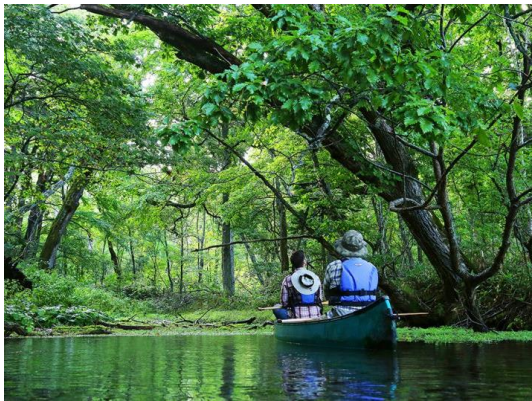
Canoeing in wetland