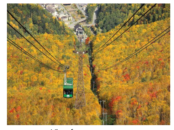
View from a ropeway