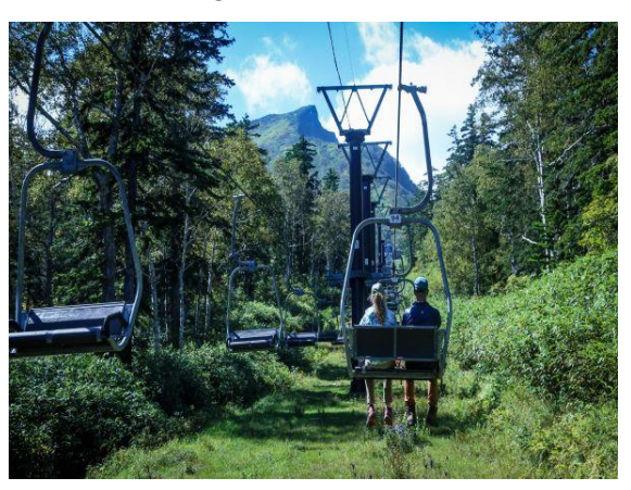
Taking a chair lift