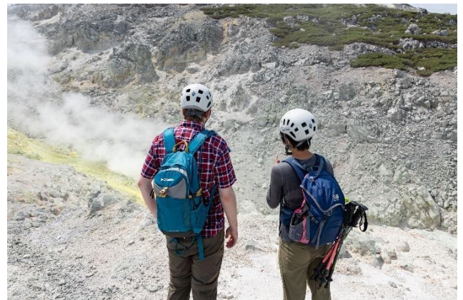
● Hike up Atusa-nupuri