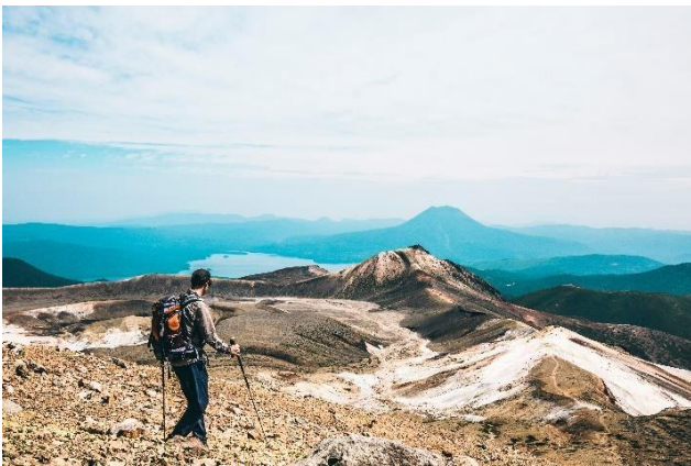
● Hike up Mt. Meakan