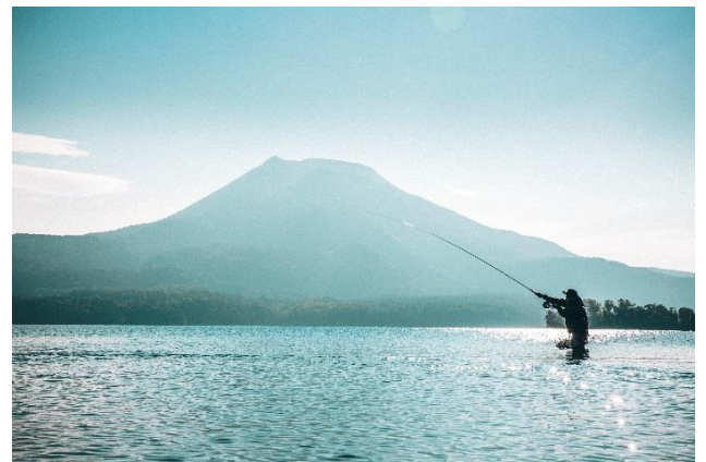
● Fly fishing at Lake Akan